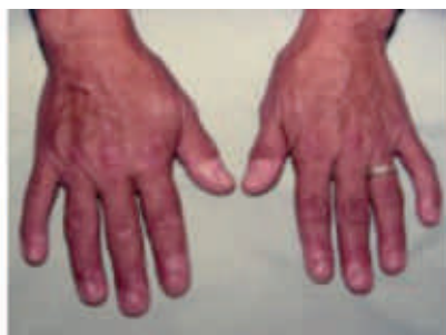
Figure 2: Hands of the Patient (Taken with permission of patient.)

His mood had become widely variable from being dynamic to apathetic and irritable. Additionally, he experienced insomnia resulting in daytime fatigue and headache.