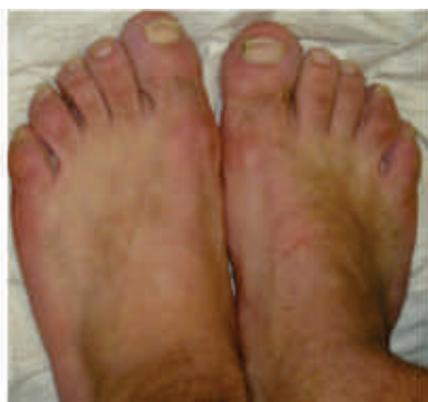
Figure 1: Feet of the Patient (Taken with permission of patient.)